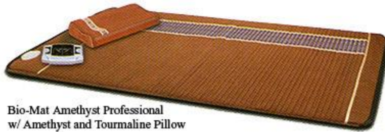
Bio-Mat Amethyst Professional w/ Amethyst and Tourmaline Pillow